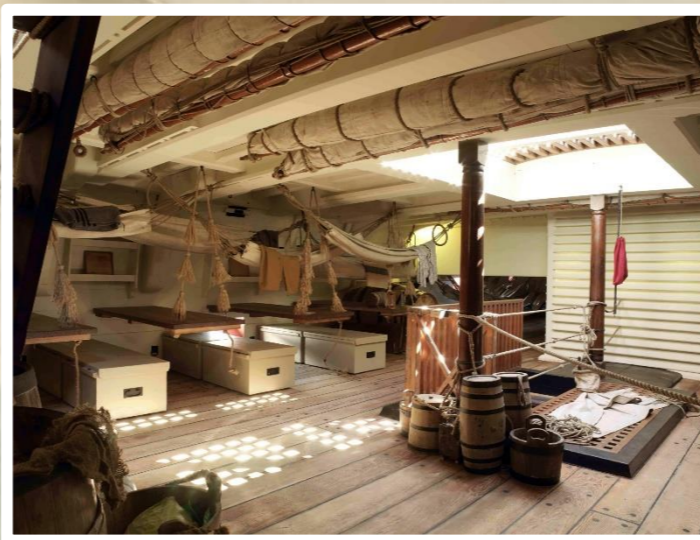
What below deck on HMS Endeavour may have looked like