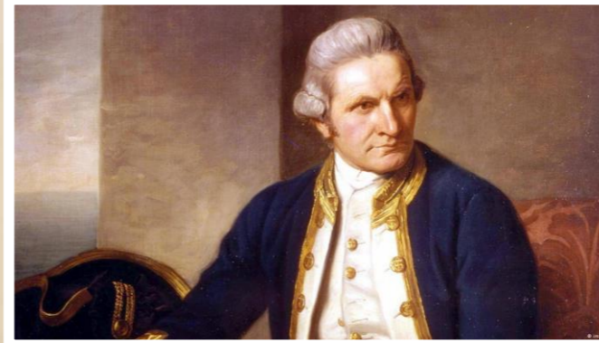
Captain James Cook