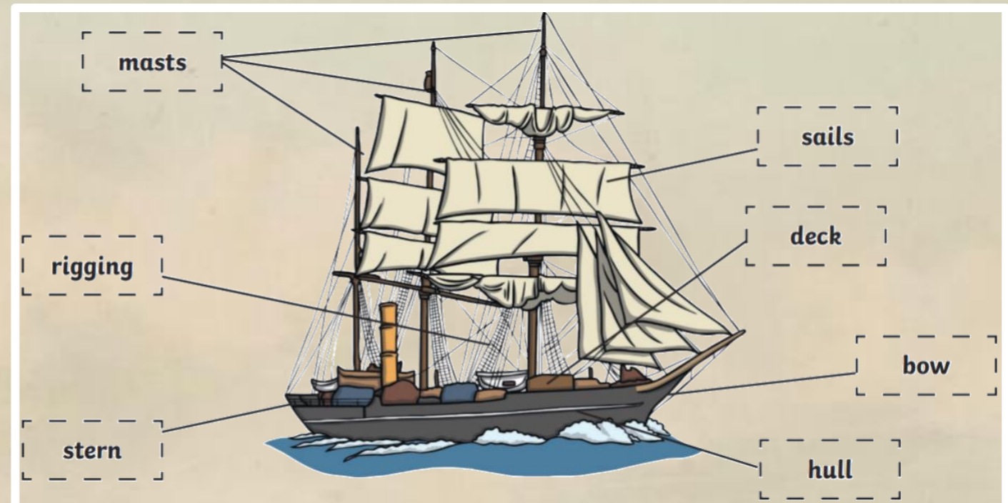
Diagram of a ship