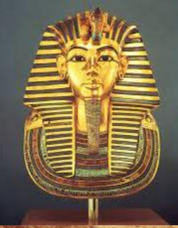
Tutankhamun's death mask

Tutankhamun was a pharaoh from ancient Egypt. Howard Carter was a British archaeologist who discovered the tomb of Tutankhamun in 1922. It is thought that Tutankhamun wasn't an especially important king, however, the discovery let archaeologists record what an Egyptian King's tomb looked like and learn more about ancient Egypt.