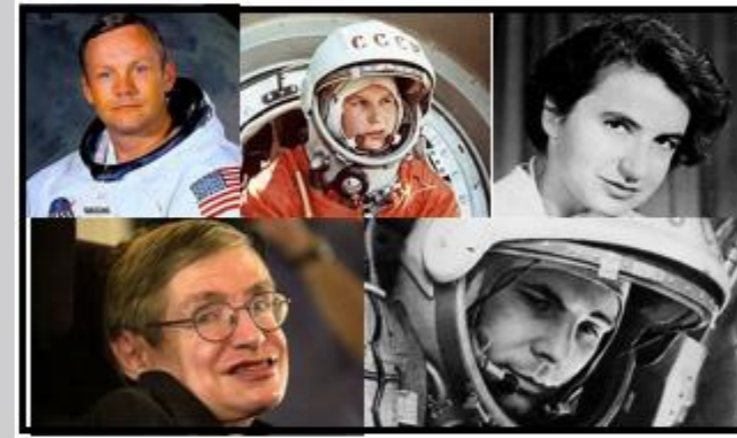
Rosalind Franklin - An important scientist who made x ray images of DNA

He was born on 7 th April 1972 in Chichester. He became interested in flying when his father took him to air shows. When he was just 13 years old, Tim joined a military program through his school. Through this program, he learned to fly with the air force on weekends.