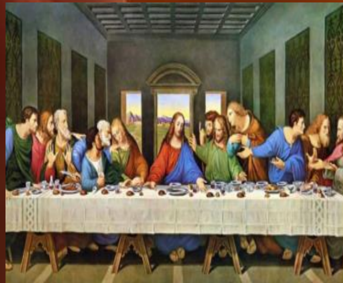
The last supper Jesus eats with his disciples